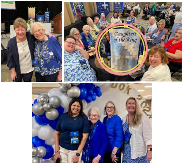
Chicagoland Assembly Daughters at Triennial ~ June 2024

Building on the energy at Triennial, our Chicagoland Daughters then brought all their interest and enthusiasm along in September 2024 and came out for the Chicagoland Fall Assembly held at St. John the Evangelist in Lockport, IL.