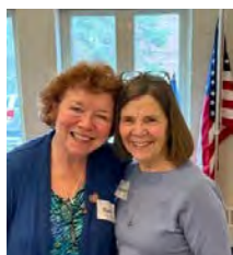
Chicagoland Spring Assembly ~ April 2025