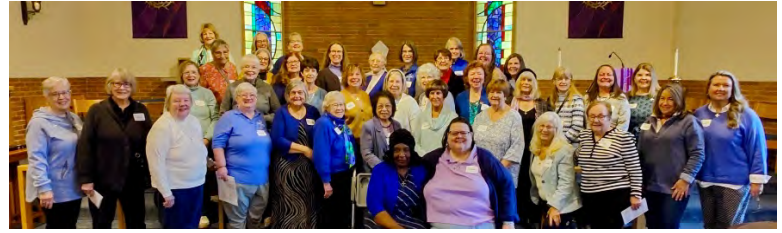
Chicagoland Spring Assembly ~ April 2025

And of course, the day concluded with a delicious lunch and fellowship together.