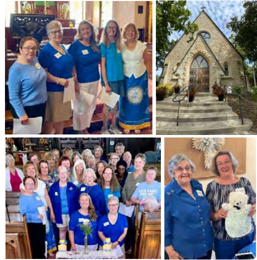
Chicagoland Fall Assembly ~ September 2024

Our Fall Assembly program included: worship, the installation of our Chicagoland assembly officers, a summary of assembly membership and finances, a recap of the activities at triennial, a “chapter service highlight segment” educating Daughters about St. John Lockport’s on-campus Little Free Pantry with staples for those in need, and then a small group break-out session during which Daughters could discuss “why DOK”. The assembly finished with a plentiful lunch and fellowship provided by our DOK sisters at St. Johns, Lockport.