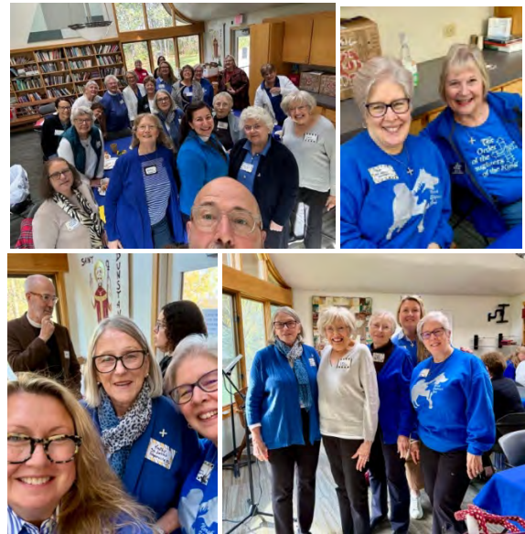
Wisconsin DOK Fall Retreat ~ November 2024